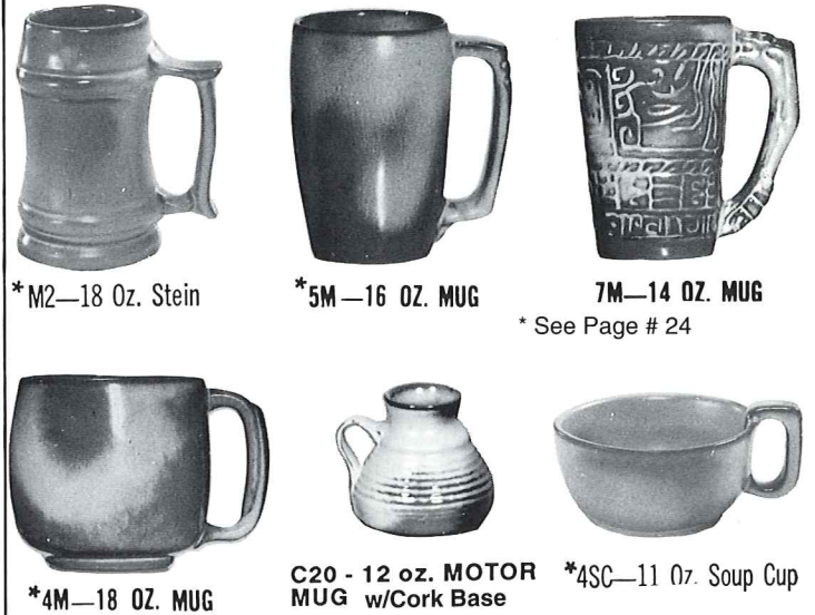
*M2—18 Oz. Stein