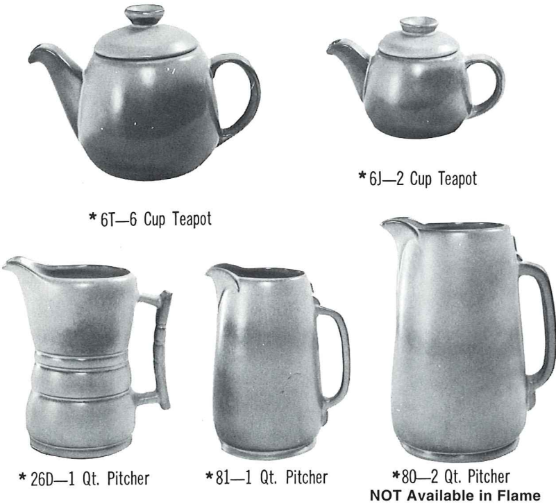
* 6T—6 Cup Teapot