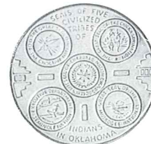
OK3—5 Civilized Tribes Trivet